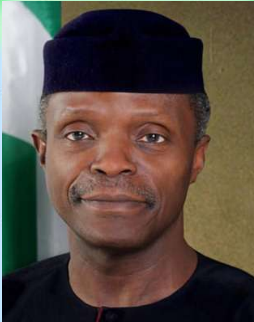
HIS EXCELLENCY PROF. YEMI OSINBAJO SAN, GCON VICE PRESIDENT FEDERAL REPUBLIC OF NIGERIA

Reforming for Socio-Economy Wellbeing of the Nation