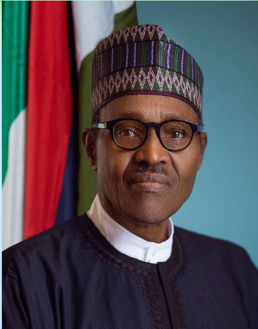
HIS EXCELLENCY MUHAMMADU BUHARI GCFR PRESIDENT, COMMANDER - IN - CHIEF OF THE ARMED FORCES FEDERAL REPUBLIC OF NIGERIA

Reforming for Socio-Economy Wellbeing of the Nation