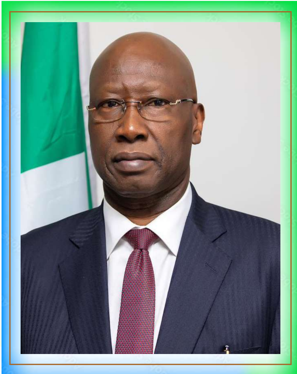
BOSS MUSTAPHA SECRETARY TO THE GOVERNMENT OF THE FEDERATION

Reforming for Socio-Economy Wellbeing of the Nation